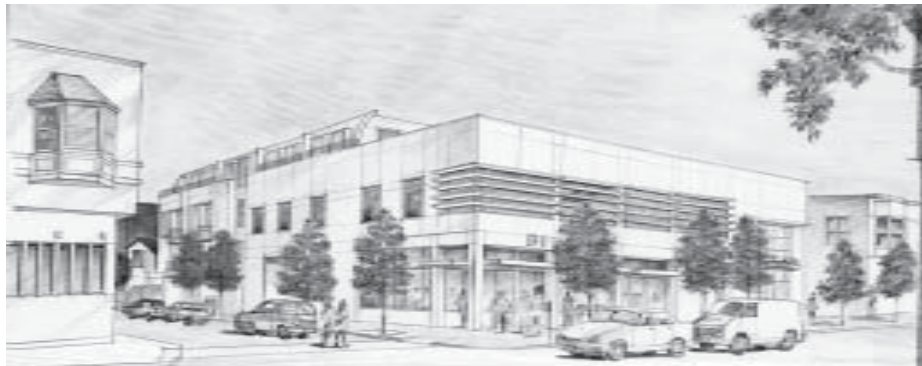
VIEW FROM DIAMOND STREET

This project will be located on Diamond Street in the heart of the Glen Park shopping district. The Glen Park marketplace will replace a neighborhood grocery store that burned in 1999 with a new grocery store topped with 15 townhouse condominiums, and a new Glen Park branch library.