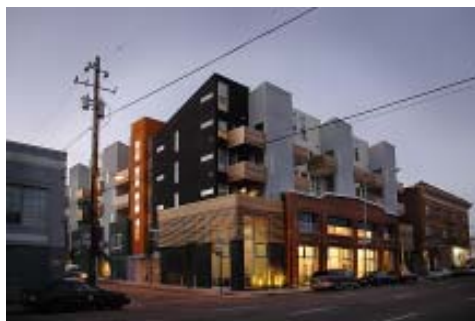
FOLSOM & DORE CORNER

This project provides affordable housing for people with disabilities, HIV/AIDS, and other low income people. With only 12 residential parking spaces (plus a 14 space neighborhood garage), a City Carshare pod and bicycle parking provides alternatives to private car use. The entry garden court transition between the hard urban exterior and the new dwellings. An existing brick facade will become part of the Folsom Street façade.