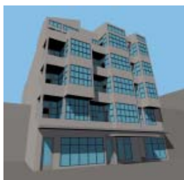
FOLSOM STREET VIEW

Currently the site of a vacant shed, 1168 Folsom Street will be a five story building with 20 2- and 3-bedroom units, 2100 square feet of ground level commercial space on Folsom Street, and a 20 space parking garage accessed from Clementina Street. This part of South of Market has a mix of uses, building sizes and styles. The building provides for continuity of both Folsom and Clementina street façades and active, street level uses.